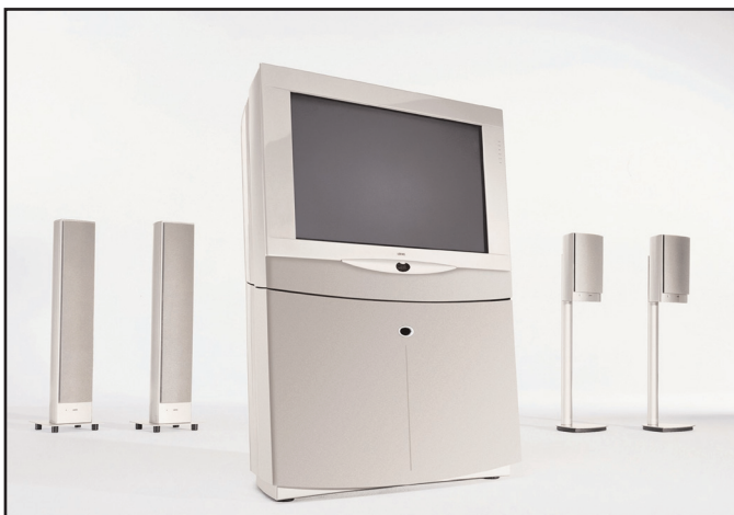
The big picture: CADfix cleans up at Loewe

Setting the standard in both design and technical quality, Loewe is a high-end market leader for television sets, video recorders, audio equipment and telephones. Consumers of Loewe electronics expect the best in terms of form, shape and technology, placing great value on the way in which Loewe products influence and complement their living environment.