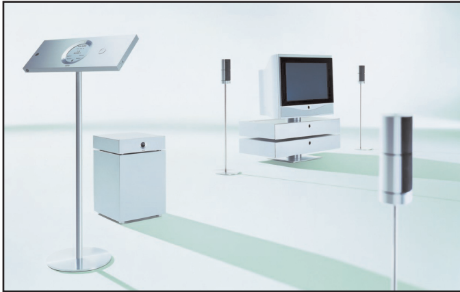
Loewe equipment is the height of fashion in Germany

that we simply couldn't read while others caused error messages that seemed to make no sense. But at Loewe the design element is the key factor in our success. This means that the arduous process of transferring all the design models into our production systems while staying true to the original had to be carried out by our designers, even though it was taking up days of a designers' valuable time."